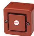
Option: case w/o fixing lugs